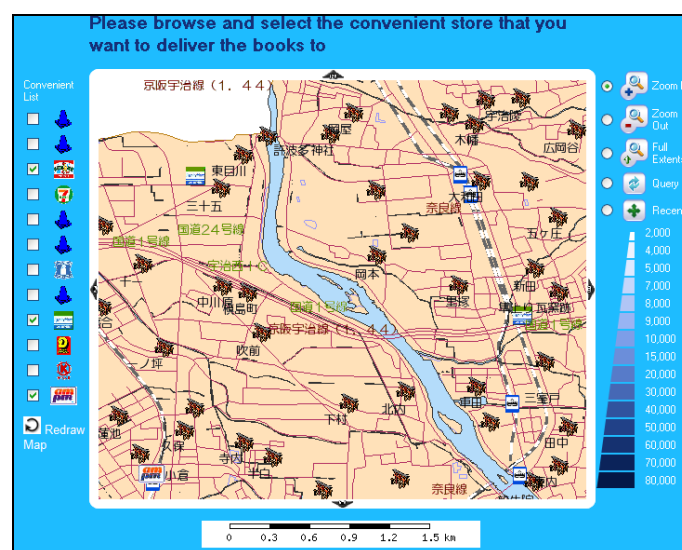
Figure 5: Specify the nearest convenience store on the map

This page’s content will then be sent as a HTML email to the administrator of the library. The order will then be carried out as in library’s standard book lending procedures.