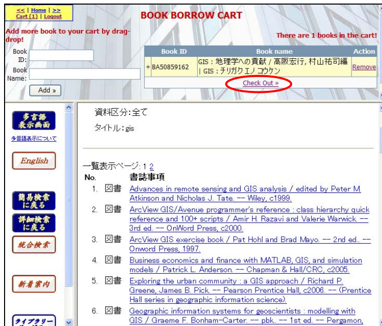
Figure 4: Browsing for information and selecting books to the shopping cart

4.4. Check-out to the web-mapping application: this module is used to select the nearest convenience store for book delivery (Figure 5). The convenience stores will be shown within city map and infrastructure map (containing roads, rivers, schools, etc.) as icons. User can select a brand of convenience stores (classified by shop name) by clicking the logo on shop selection menu to have all selected-brand convenience stores to be shown on the map with name and address information. The position of convenience store can be checked by “Zooming to Shop” function that will set extent of map to the selected shop position on the map.